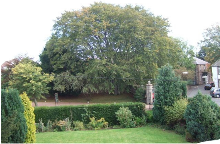
Before and after The Fall Of the Beech Tree